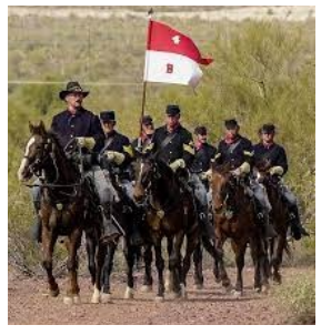
Ft. Huachuca's B Troop unit will be represented in our parade.

US Army 'Mormon Battalion' raises the American flag in Tucson in 1846 shortly after passing through the San Pedro Valley.