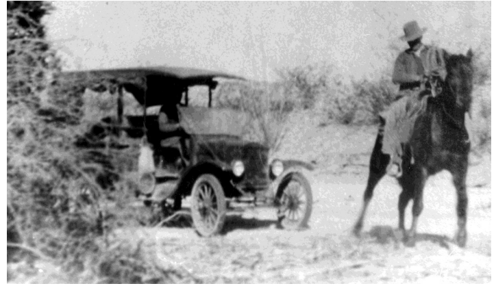
Do you know the story behind this photo? It just might have something to do with digging for rare fossils in St. David nearly a century ago...and the rest of the story is in the new book, Chile Peppers & Mastodons.